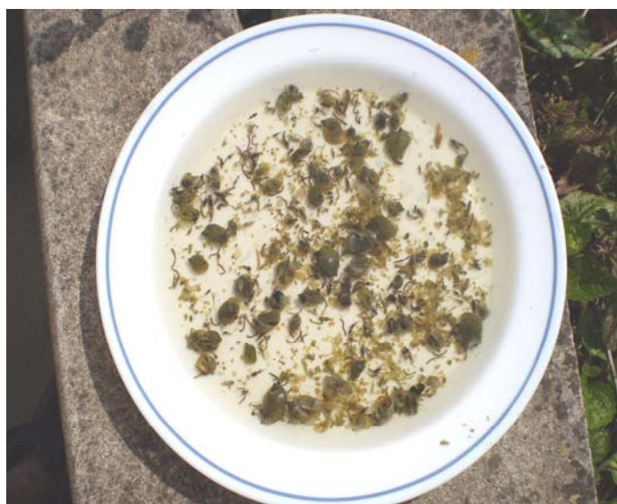
"The stomach contents of an over wintered 4lb 14 Rainbow ex of Old Hall Bay"

He will be much missed and always remembered for his cheerful bank-side banter. Our condolences go out to his family.