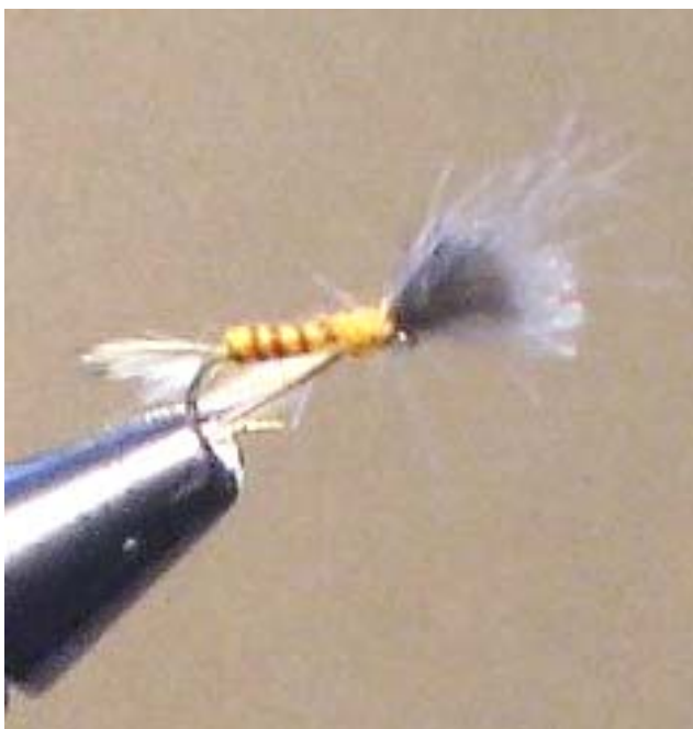
"JW's Sedge Pupa, tied with a CDC head which has taken a few fish for John around the Old Hall Bay and Mowmires areas of the lake"

With two rounds to go, both at Grafham - one in early September, the other early October - there is still all to play for!