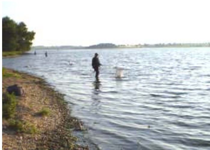
"Malcolm Shepherd landing fish at Mowmires"

The best place is still the main basin area for both bank and boat.