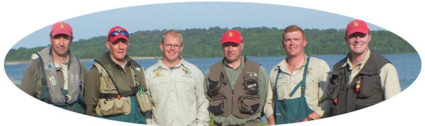
Soldier Palmers 'A' WINNERS

The match finished as always at 6pm sharp and with the fish weighed the band of brothers, or most of them anyway, retired to the Brown Trout in Lamberhurst for evening dinner.