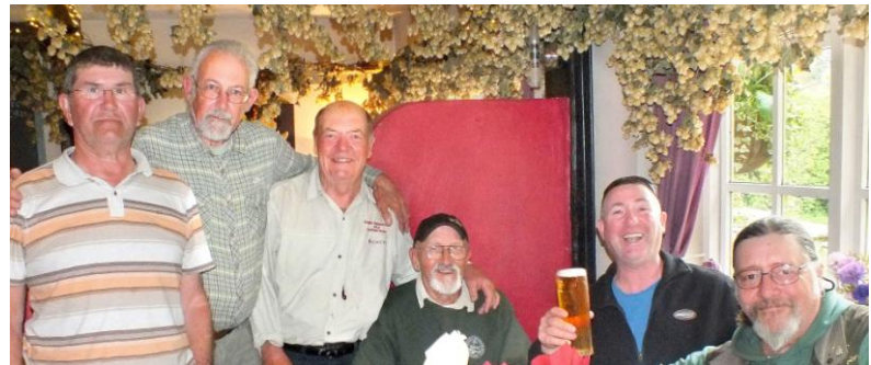
Bewl 'B' Winning Team

This was also mirrored with a very wide variety of flies. This is perhaps what makes the AMFC such a good forum.