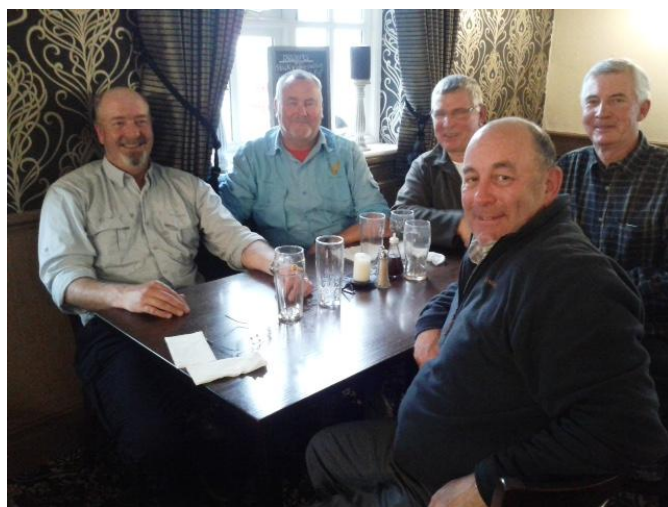
The successful Grey Lags Team