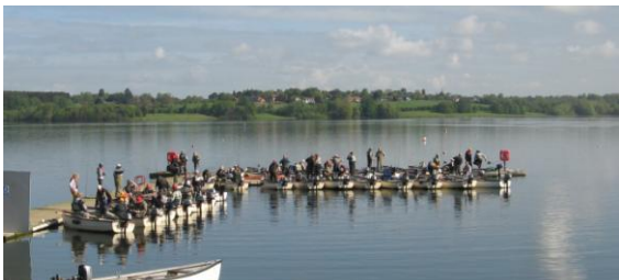
Draycote was a flat calm at the start of the Match

And even before the start the water was covered in buzzers!