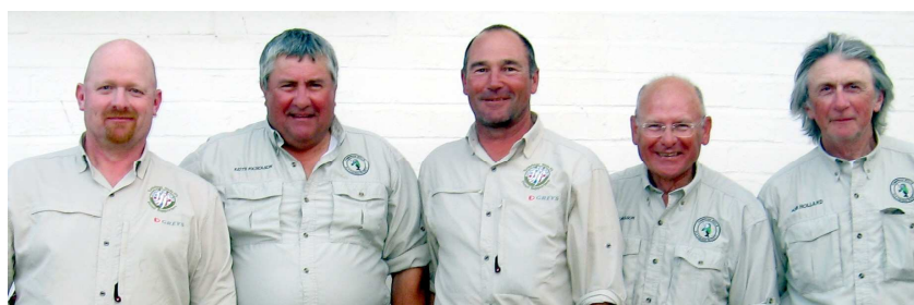
Tunbridge Wells F.F.S. Winners with 145lbs 8oz

The meal at the Green Man in Dunchurch was excellent. Either an 8oz steak or half a chicken with chips and salad. A tasty cheese cake, or cheese and biscuits followed.