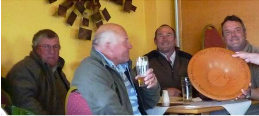
Best Team Performance And Winners of the Kew-Queen Mother Plate **** Tunbridge Wells Fly Fishing Society Group Two 17 fish for 49lbs 14oz