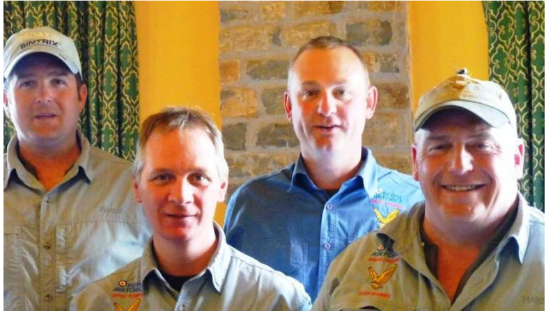
Group Three Winners *** Invicta F.C. 'A' 12 fish for 31lbs 6oz