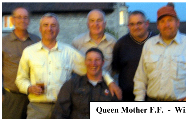
Queen Mother F.F. - Winners