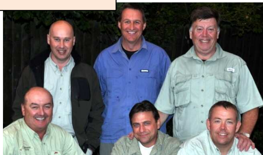
England Police F.F.A.

Outside the lodge booms and towards the sailing club fish were rising steadily to these throughout the day. Rods were seen to bend every so often to nymphs on floating and sink tip lines. A windless few hours and dead air during the early afternoon showed the green algae to be quite heavy although a little breeze later on helped fly presentation and boat drift.