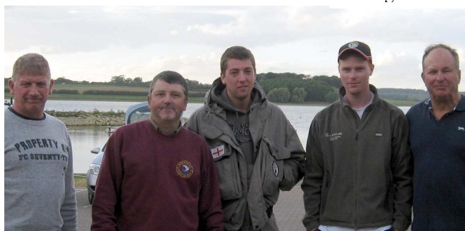
Hanningfield F.A. - Winners

The fishing boats had to concentrate on the margins of the shoal of fish. For most,