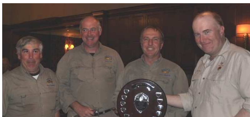
Grafahm Water F.F.A. 'Farmers' WINNERS

The Association would like to thank the following sponsors who provided the prizes: