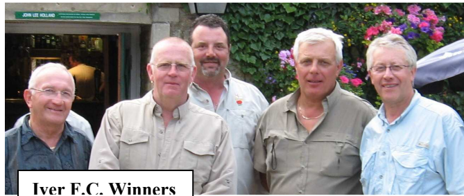
Iver F.C. Winners

By mid day Rutland was a flat calm. By mid day the cloud had burned off and it was HOT . Additionally the widespread algae bloom covered most of the reservoir.