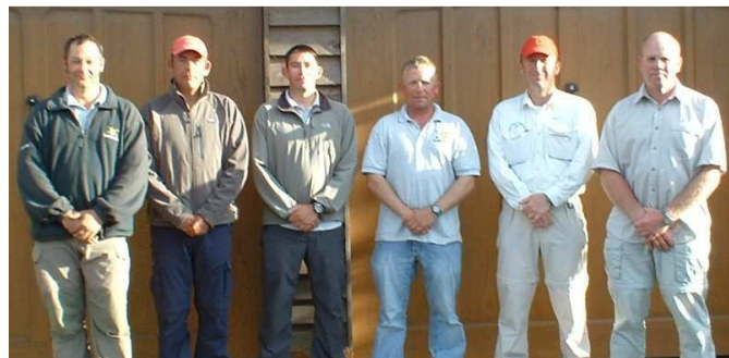
Soldier Palmers 'A Team - Winners