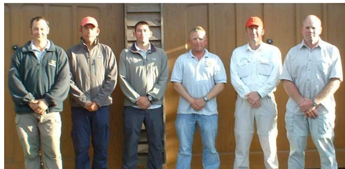
Soldier Palmers 'A Team - Winners